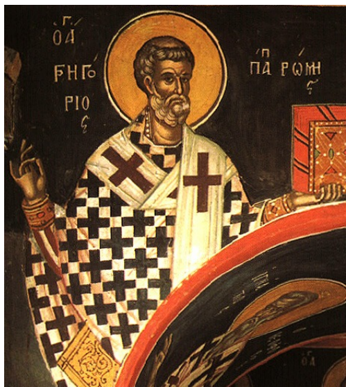
Athonite Fresco of Saint Gregory

This meeting will focus on how we would like to celebrate at local, Diocesan and Provincial level with our sister Branches. We have been challenged to make 2026 a real celebration of MU so look out for ways you can join in.