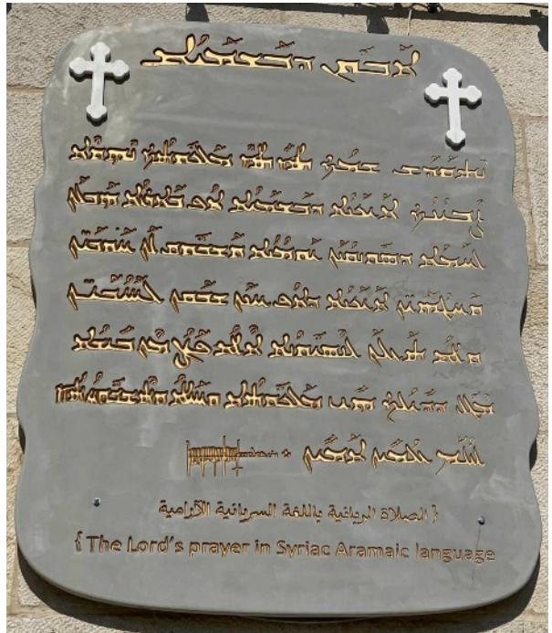
The caption on the plaque reads: The Lord's prayer in Syria Aramaic language