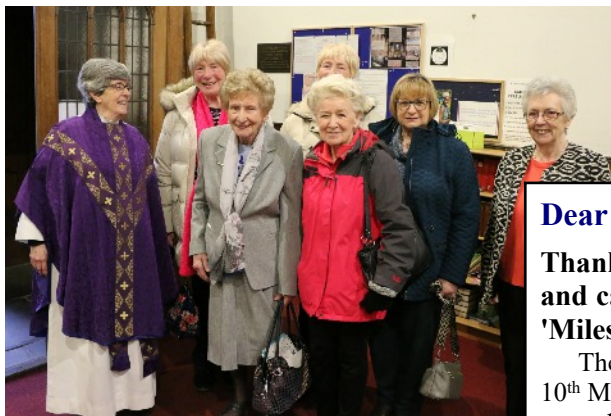
Opposite below: Happy Birthday!!