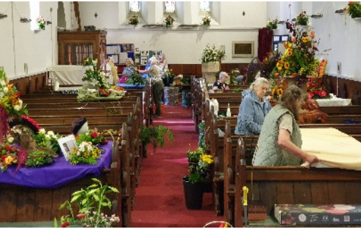
It's all coming together nicely!

Here are some pictures that didn't make it into the calendar, but show some of the people who made the Flower Festival a great event in our church's history.