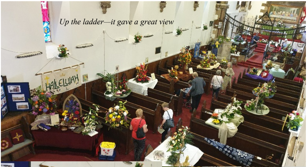
Up the ladder—it gave a great view