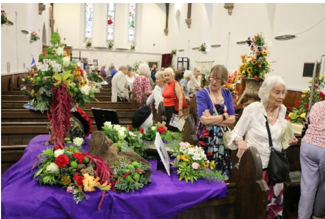
One of the many busy times