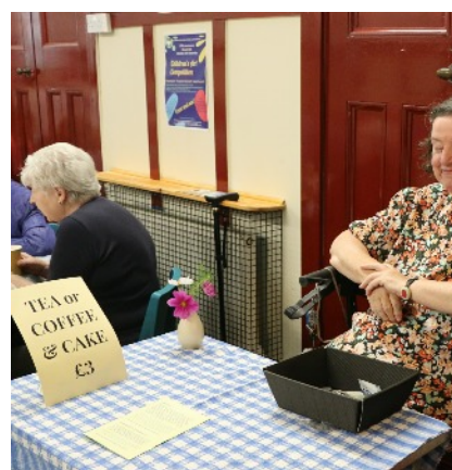
Everything stops for tea—but not