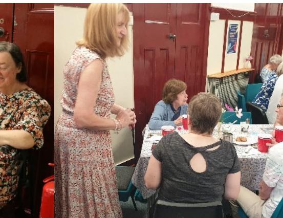
the staff of the tearoom who were kept very busy