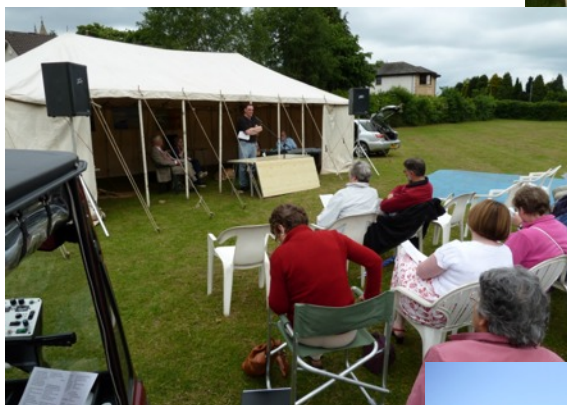
Above: Outside and inside the marquee