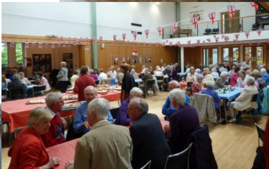
Above The "Big Lunch"