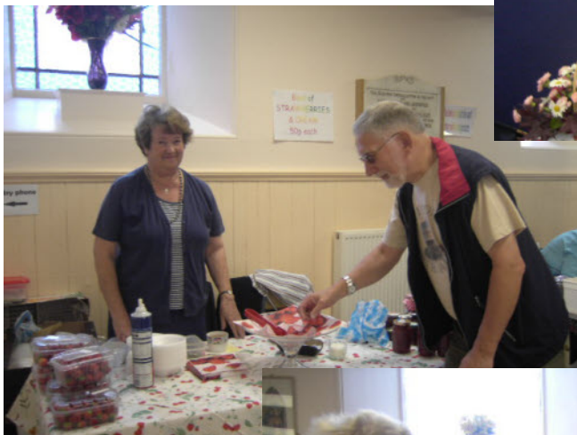
Right: "I'll just have one more!"