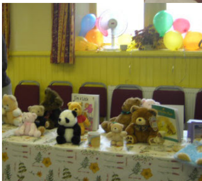
Left: The Teddy Raffle