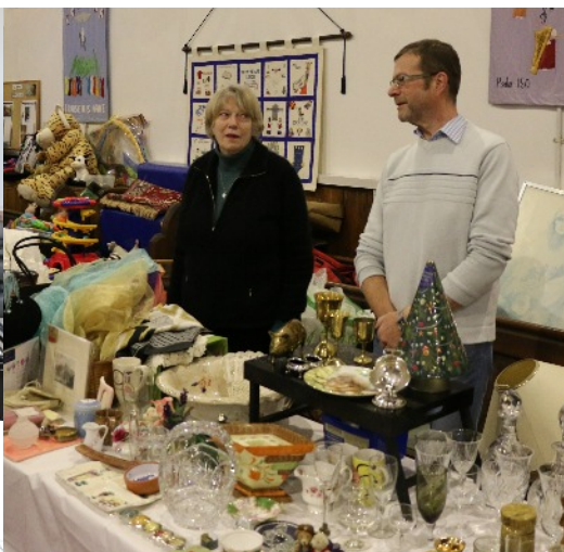
carbooter ( above ).