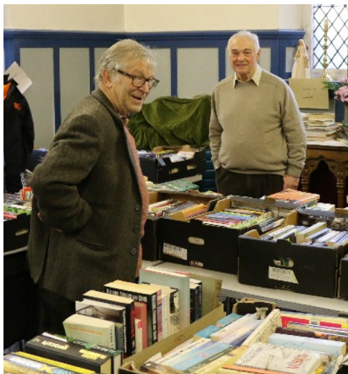
Our book stall cleared loads of books, with two great philosophers ( above ) taking your money with enthusiasm.